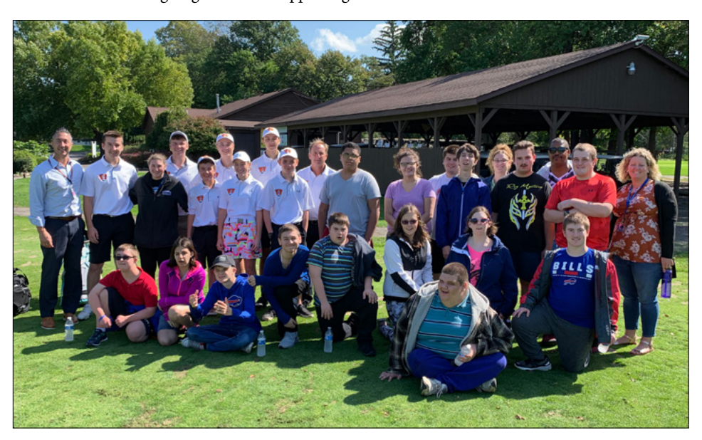
Wilson Golf Team with the Orleans/Niagara BOCES Life Skills students.